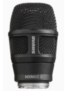
RPW204 Nexadyne 8/S Supercardioid Dynamic Vocal Microphone Wireless Capsule for Shure Handheld Transmitters (Black)