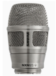
RPW206 Nexadyne 8/S Supercardioid Dynamic Vocal Microphone Wireless Capsule for Shure Handheld Transmitters (Nickel)