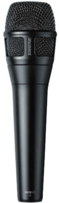
NXN8/S Nexadyne™ 8/S Supercardioid Dynamic Vocal Microphone