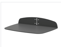
UTILITY SHELF DARK GREY 97-507-282

Additional accessories available in white