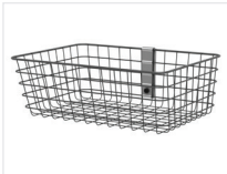
LARGE WIRE BASKET DARK GREY 98-135-282