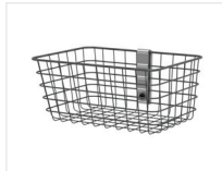
SMALL WIRE BASKET DARK GREY 98-136-282